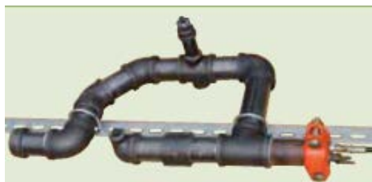
Burst pressure testing of DI threaded fittings (2")

Ductile Iron Class 300 threaded fittings are designed to the same basic dimensions as that of Class 150 malleable iron fittings. Though due to the superior strength characteristics, ductile iron fittings carry a much higher pressure rating. Laboratory tests confirm Shurjoint ductile iron fittings have passed hydrostatic test pressures exceeding 6,000 psi / 414 Bar, which is equal to four times the 1,500 psi / 103 Bar as specified by ANSI B16.3 for 1 1/2" – 2" sizes..